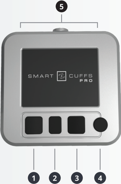
SmartCuffs PRO Device